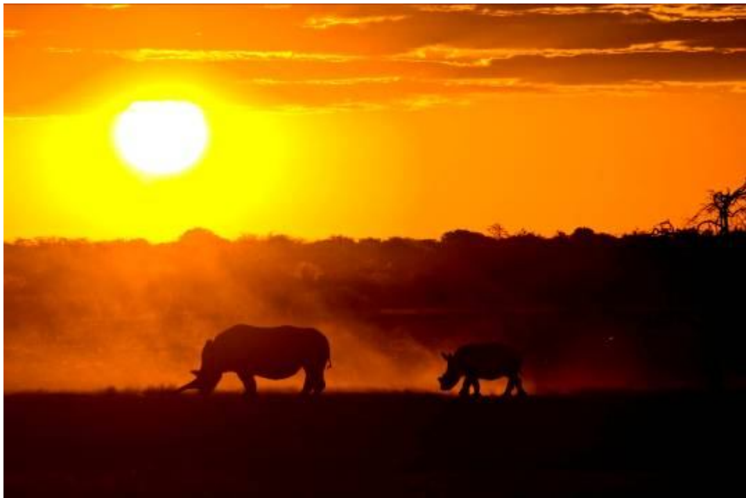
Rhinos at Sunset – taken by Loftus at Khama in Botswana. Canon EOS 20D with Canon 100-400mm lens, 1/2000 th sec, F/9,.